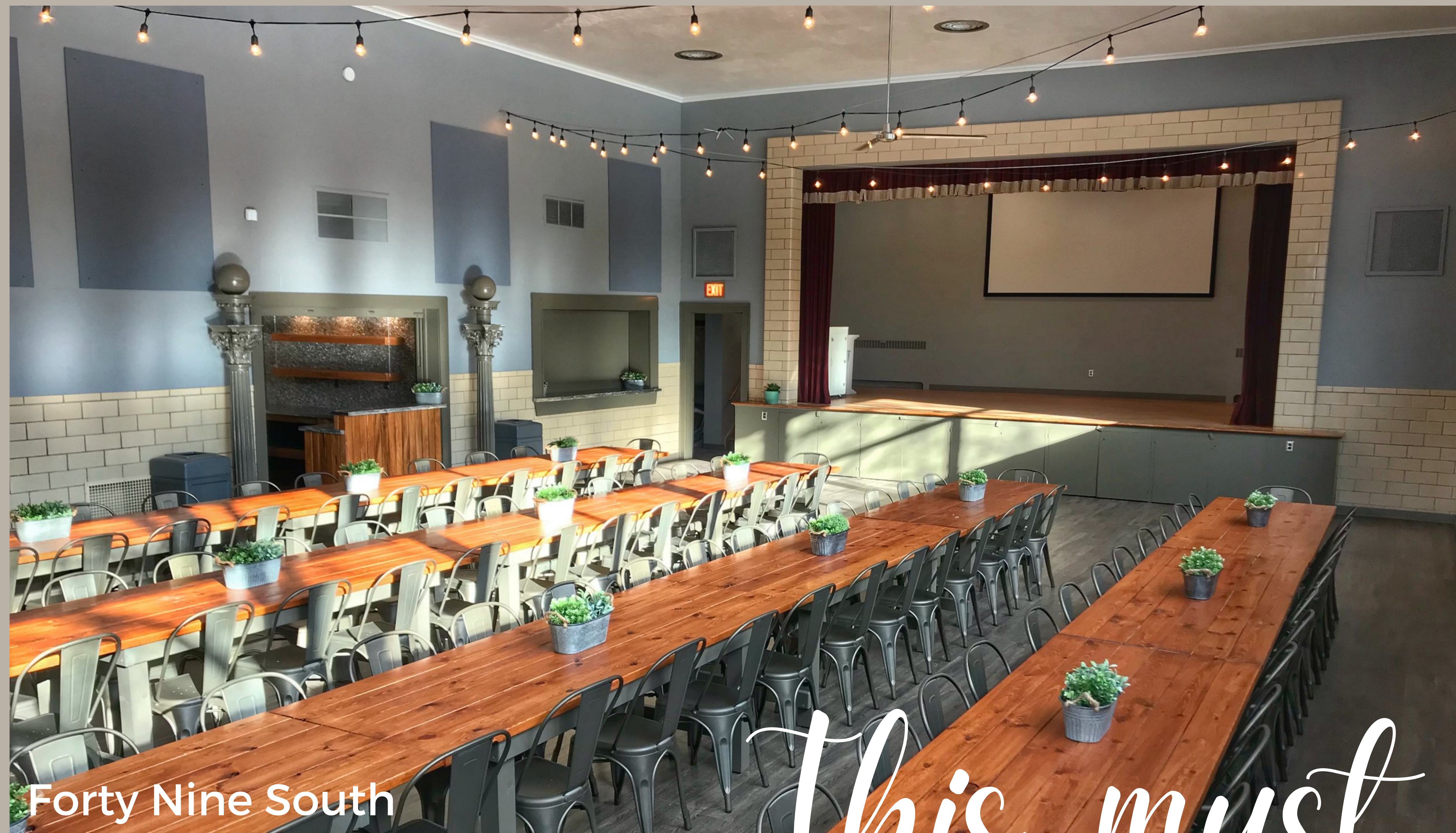
Forty Nine South