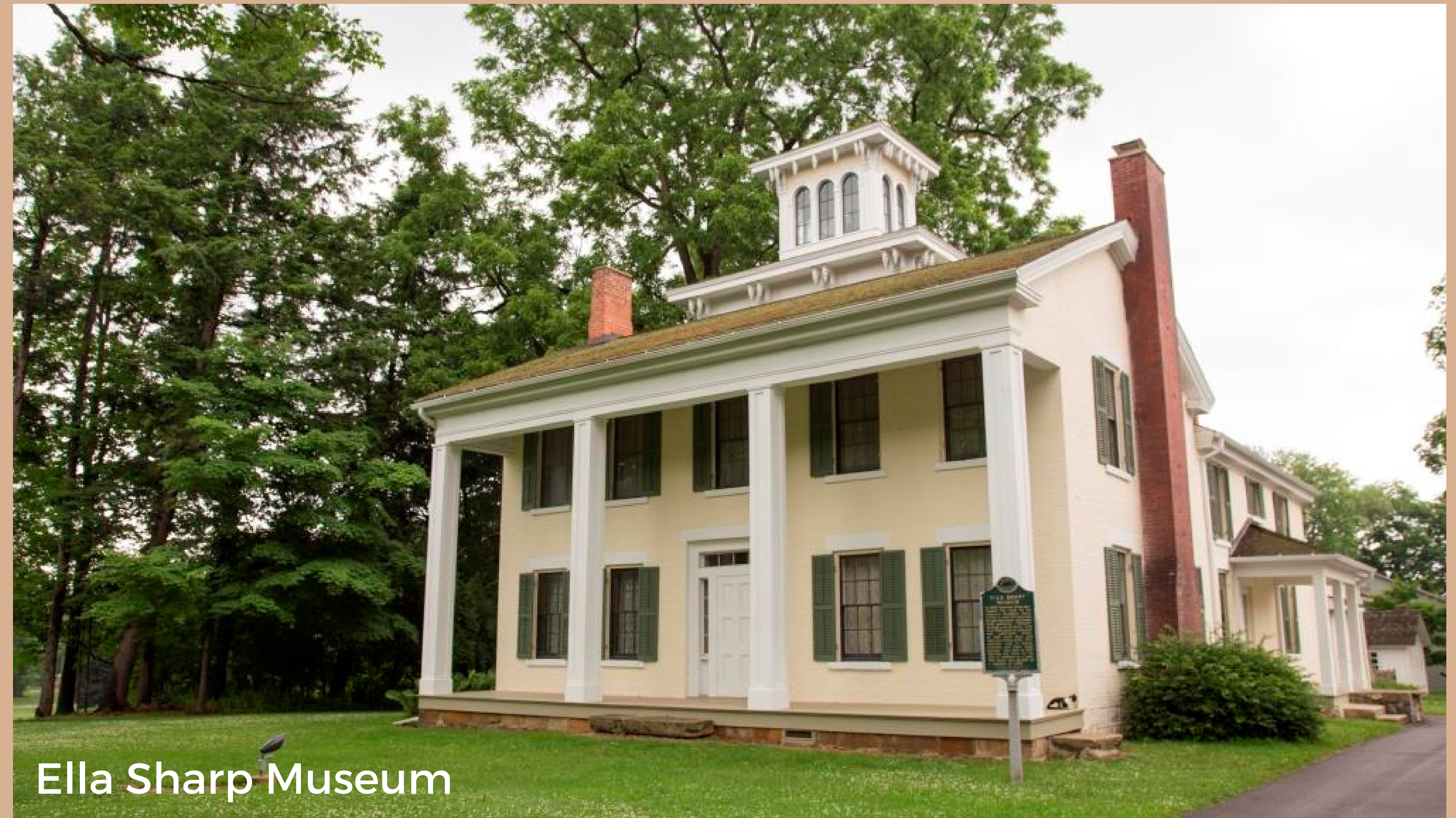
Ella Sharp Museum