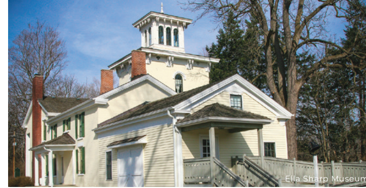
Ella Sharp Museum

Imagine the time before paved streets, cars and buses. Now you can re-visit a 1900's village where the electric Interurban railway system was the primary mode of public transportation and see how the history of transportation was changed. Several railways delivered visitors to and from Ann Arbor, Jackson, Battle Creek, and Lansing; you will be able to see what the intersection of transportation was like at the Lost Railway Museum. Before you go, make sure to take the Boland Express, a virtual train experience on site. Leaving Jackson Platform 517, Car #29 will take you on a ride back in time.