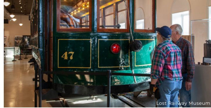
Lost Railway Museum